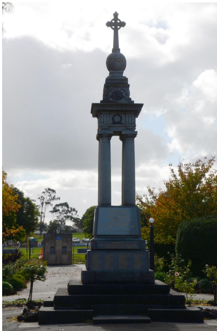
Mount Gambier War Memorial